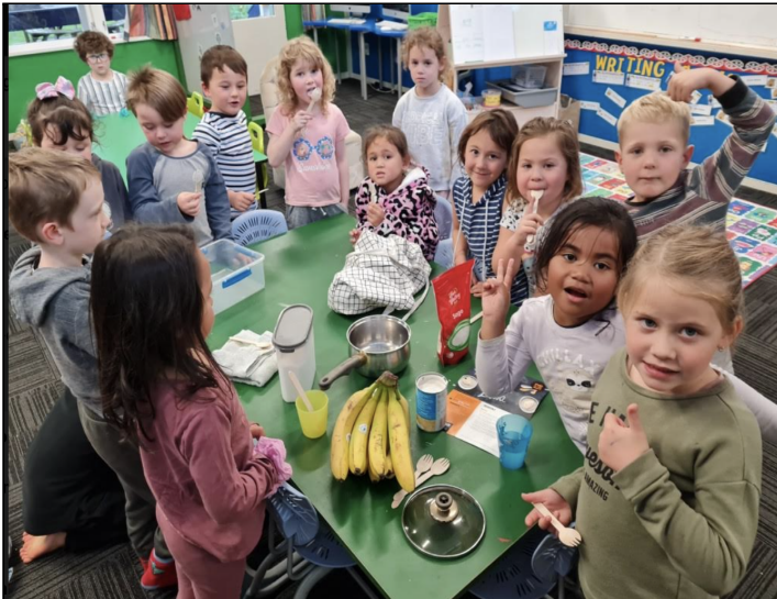
Junior classes making Sua fa'i - Banana sago, creating their own lei, trying new tropical fruit, and making siapo patterns.

This year marks twelve years since Samoa Language Week has been celebrated in Aotearoa, New Zealand. 2022 is also a significant year for the Samoan community, being the 60th anniversary of Samoa's Independence.