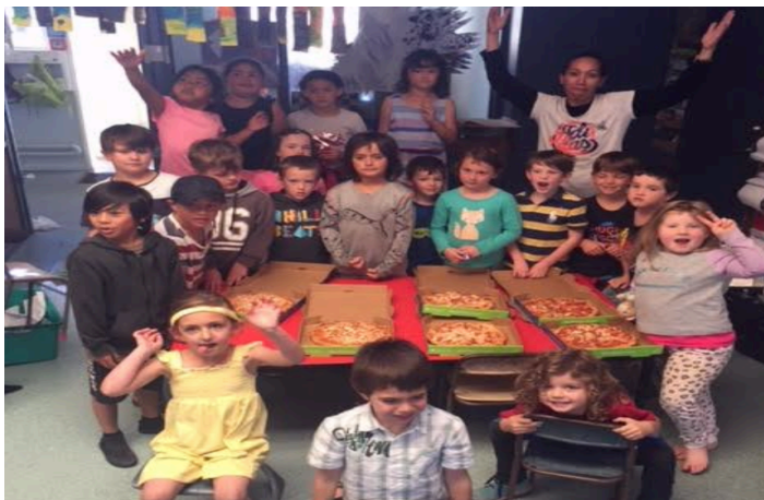
Well done Room 7!! Our 'Tidy School' Ambassadors For Term 3

Levin North School is a positive, caring community, which promotes lifelong learning, celebrates individuality and encourages participation and success for all.