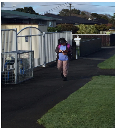
Reading on the way to school

Remember children need to experience a variety of reading materials eg picture books, hard backs, comics, magazines, poems and information books. Keep an eye out for the themes that catch your child's imagination at school - and help follow it up with more reading.