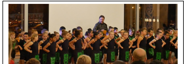
Thanks Classic Apparel!!

Next Thursday our student leaders are organising a gumboot day . Children can come to school in their gumboots and there will be lots of fun activities based around gumboots for them to take part in. The kids are asking if everyone can bring a gold coin as a donation to help the people of Edgecombe.