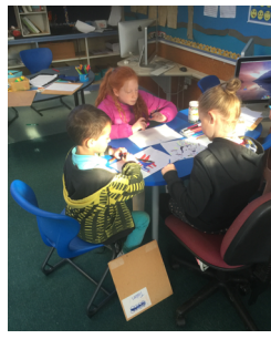
Monster maths – alive and well in Room 8