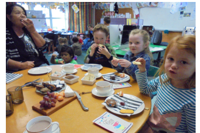
High Tea is served in Room 5. Cup of Milo for anyone?