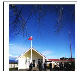
Two workshops down - a bit more relaxed!

In summary, I came away with even more understanding that there is big part of my world that I know very little about and as we move forward as New Zealanders, this surely needs to be addressed! We were inspired by the knowledge on our doorstep and look forward to having our tamariki and whanau have this experience.