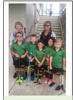
End of the first season for this little group Well done everyone!

The winter term will see our children involved in soccer, netball and basketball and if you would like your children to have the opportunity, keep an eye out in the newsletter for the notice! It helps the children in all sorts of ways!